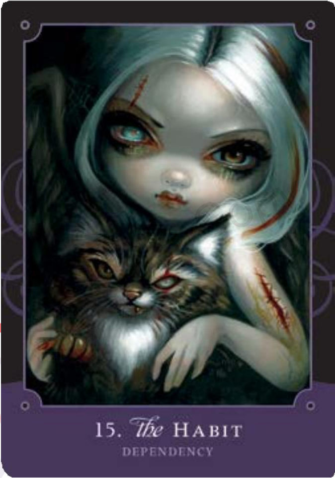
15. The HABIT DEPENDENCY