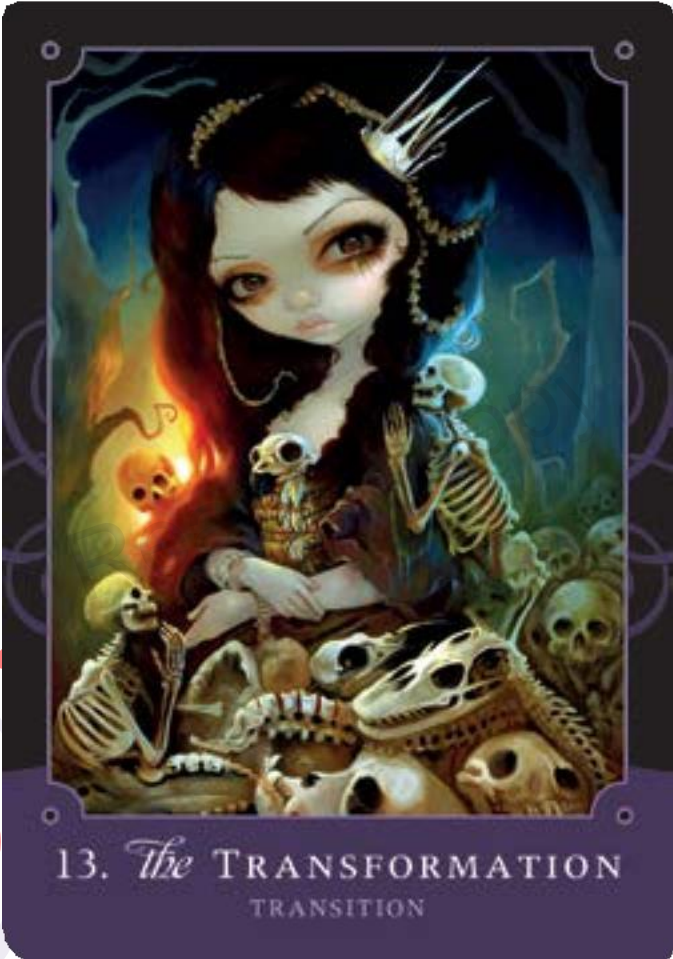
13. The TRANSFORMATION TRANSITION