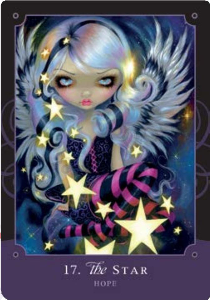
17. The STAR HOPE